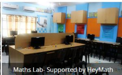
Maths Lab- Supported by HeyMath