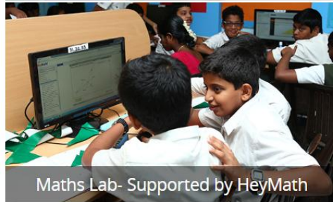
Maths Lab- Supported by HeyMath