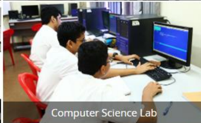
Computer Science Lab