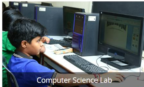
Computer Science Lab