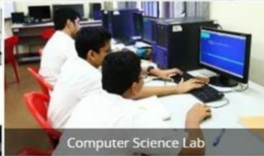
Computer Science Lab