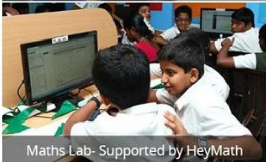
Maths Lab- Supported by HeyMath