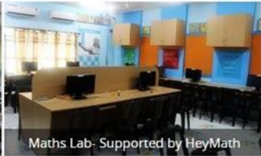
Maths Lab- Supported by HeyMath