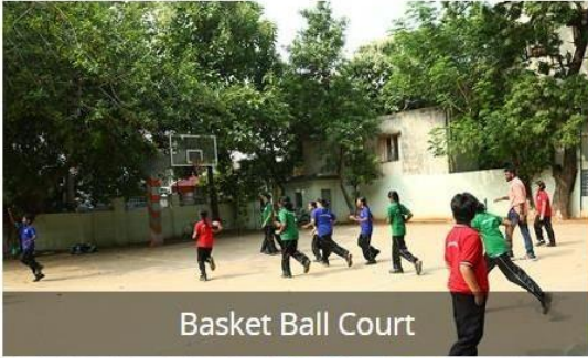
Basket Ball Court