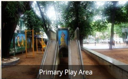
Primary Play Area