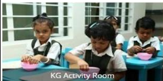
KG Activity Room