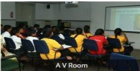
A V Room